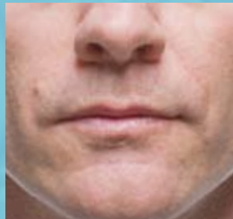
Nasolabial Folds - In Men