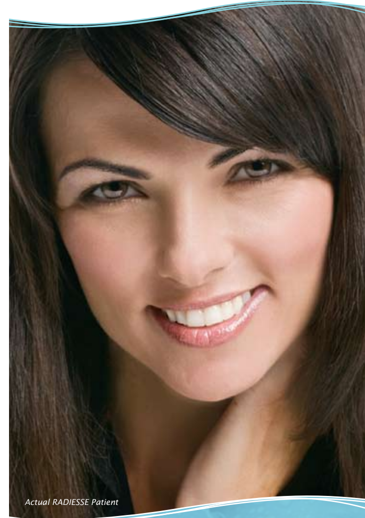
Actual RADIESSE Patient

INSTANT WRINKLE CORRECTION... THE MAGIC INGREDIENT IS YOU!™